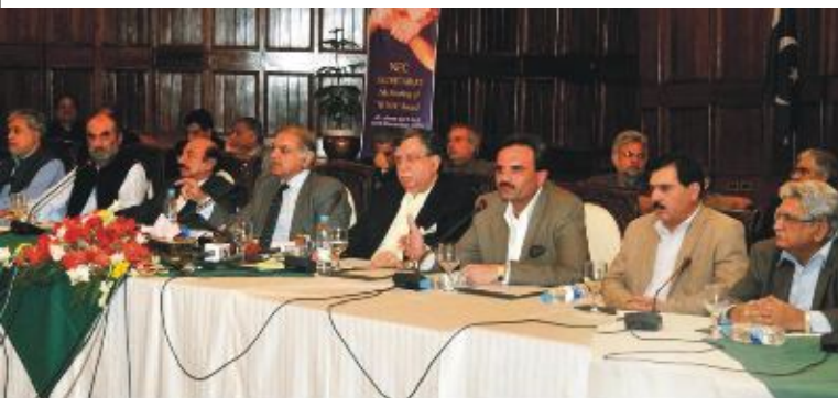
The 7th NFC is the first such Award with a new national spirit to accommodate the demands of the smaller provinces.

Baloch people who have suffered a lot under the last authoritarian regime. The presence of Pakistan's democratic leadership in Gwadar was historic in a way to assure the Baloch people that the State of Pakistan under the democratic leadership has been transformed from a callous alien to a caring mother. It has been widely recognized that the hammering out of a consensus among the Centre and the provinces on the 7th NFC Award is a major achievement and a positive event for those who believe that the future of a vibrant Pakistan lies in a democratic Federation. 2