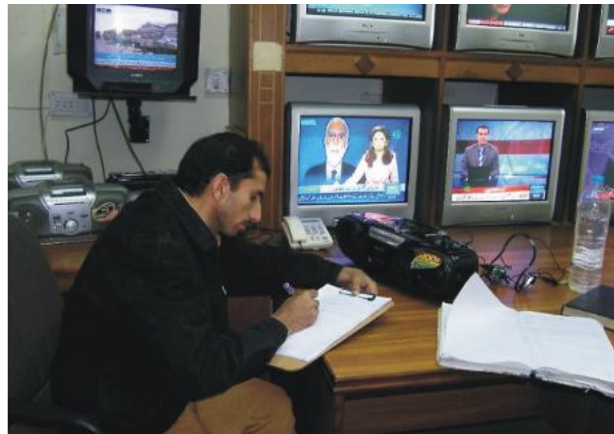
Taking advantage of Pakistan's media and information revolution, the People's Government is setting the contours of a constructive new social discourse.

Government is setting the contours of a constructive new social discourse that will purge the vestiges of authoritarianism and extremism, heal the nation's wounds, and give the people hope, courage and resolve to move forward with confidence in a democratic dispensation. Like Pakistan's democracy moving towards maturity, Pakistan's mushrooming media is also journeying towards maturity. A partnership of the two will create an articulate Pakistan that knows where it belongs and where it is headed: