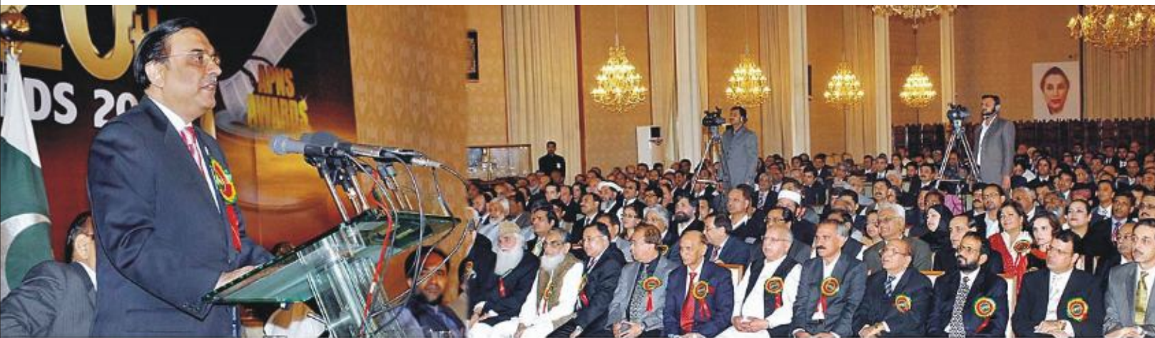
President Asif Ali Zardari addressing the APNS gathered at the Presidency on March 10, 2010.

"We are confronted with a war of ideas — tolerance vs. extremism, democracy vs. authoritarianism, rule of law vs. anarchy, heterogeneity vs. homogeneity and exclusivity vs. multiplicity. In this war, Pakistan's vulnerable population segments are exposed to the message of terrorists, becoming fodder for their sinister recruiting techniques."