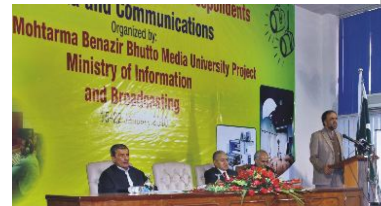
Federal Information Minister, Qamar Zaman Kaira, addressing the conclusion of a training workshop for journalists held under the SMBB Media University Project.

The People's Government has initiated the Shaheed Mohtarma Benazir Bhutto Media University Project with an aim to establish a state-of-the-art media university in Islamabad. A degree-awarding university focusing on media studies, mass